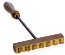
Image has been mirrored, so that branding could be read

Discover new mediums for your research or share treasured possessions via your membership in the PF of A.